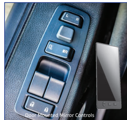
Door Mounted Mirror Controls